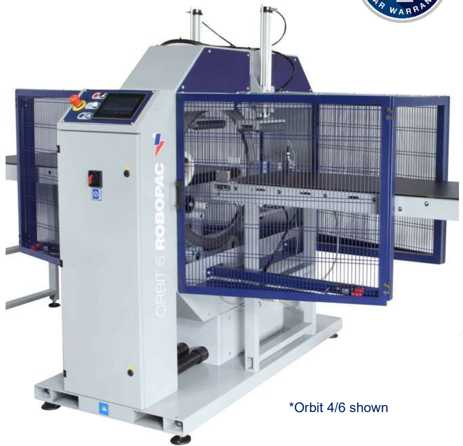
*Orbit 4/6 shown